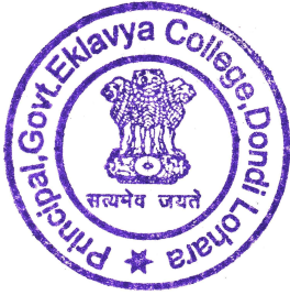
Principal Govt. Eklavya Collage Dondi Lohara, Distt. Balod (C.G.)